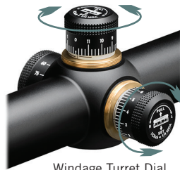
Windage Turret Dial