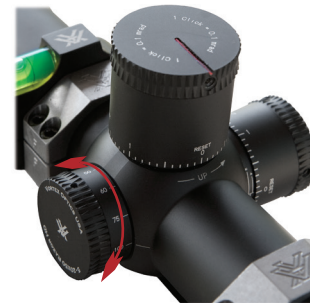
Adjust the side parallax knob

Parallax is a phenomenon that results when the target image does not quite fall on the same optical plane as the reticle within the scope. When the shooter's eye is not precisely centered in the eyepiece, there can be apparent movement of the target in relation to the reticle, which can cause a small shift in the point of aim. Parallax error is most problematic for precision shooters using high magnification.