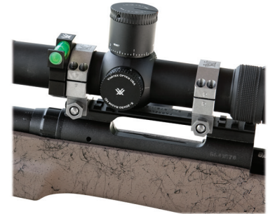
Use 35mm rings for the Razor 5–20x50

Vortex Optics highly recommends using the matched Vortex Optics Omega 35mm precision ring sets which may be purchased from an authorized Vortex riflescope dealer. These rings will mount to any quality Weaver or Picatinny type base.