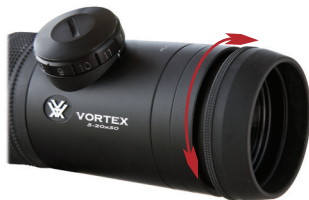
Adjust the reticle focus

Try to make this particular adjustment quickly, as the eye will try to compensate for an out-of-focus reticle.