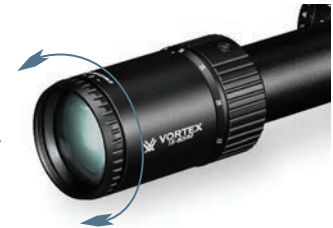
Adjust the reticle focus

Once this adjustment is complete, it will not be necessary to re-focus every time you use the riflescope. However, because your eyesight may change over time, you should re-check this adjustment periodically.