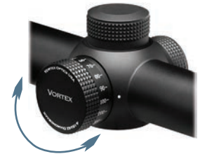
Adjust the side focus knob

Parallax is a phenomenon that results when the target image does not quite fall on the same optical plane as the reticle within the scope. When the shooter's eye is not precisely centered in the eyepiece, there can be apparent movement of the target in relation to the reticle, which can cause a small shift in the point of aim. Parallax error is most problematic for precision shooters using high magnification.